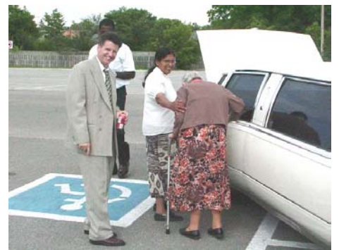
Here are some pictures to remind us of church events during the summer months. We will miss this summer!